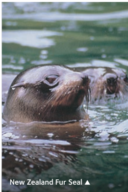
New Zealand Fur Seal ▲