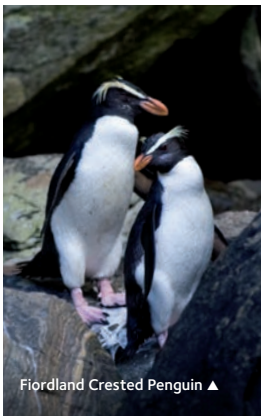
Fiordland Crested Penguin ▲