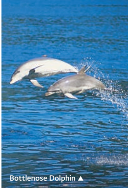
Bottlenose Dolphin ▲