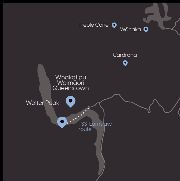
Whakatipu Waimāori Queenstown and Walter peak