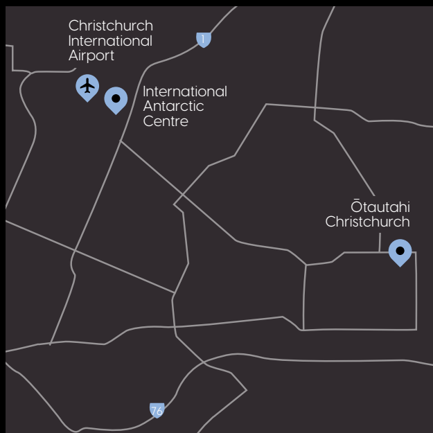
International Antarctic Centre