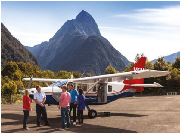
High-wing configuration provides excellent viewing.