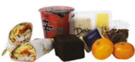
Deluxe Noodle Lunch