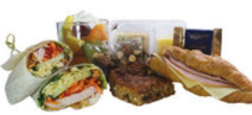
Deluxe Picnic Lunch

Vegetarian and dietary options available