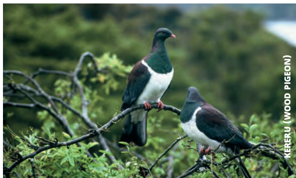
KERERU (WOOD PIGEON)

Note: Minimum age 14 years & minimum numbers apply (four adults).