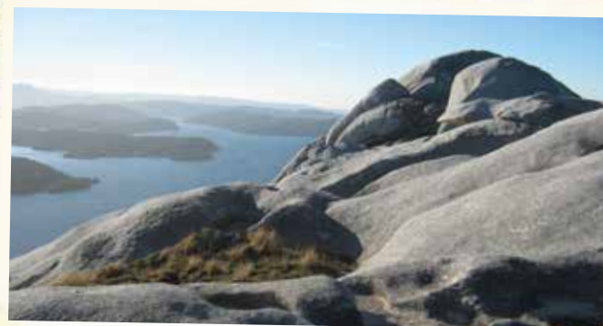
BALD CONE, SOUTHERN STEWART ISLAND. A scenic half-day hike onshore.

Protected by both geography and law, Fiordland and Stewart Island offer insights into the world as it once was – raw, pristine and largely uninhabited.