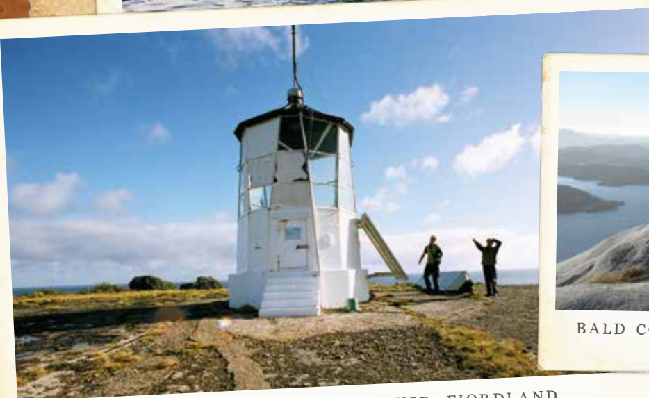
PUYSEGUR POINT LIGHTHOUSE, FIORDLAND. One of the many historic sites we visit.