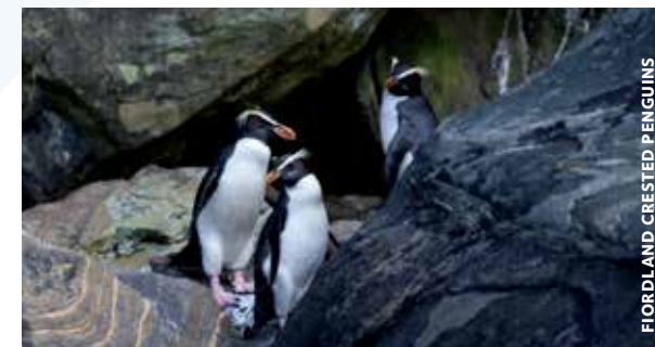
FIORDLAND CRESTED PENGUINS

* The MV Sinbad will operate at 11am & 4.15pm. Complimentary pick-ups from most accommodation.