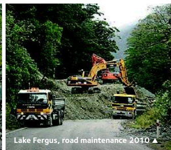
Lake Fergus, road maintenance 2010 ▲

After such incredible challenges the celebration was huge when the first private car drove through. Nowadays, with constant monitoring and management of avalanche risk still absolutely vital, visitors safely travel the 1.29 kilometre tunnel.