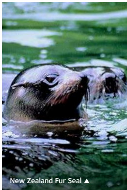
New Zealand Fur Seal ▲