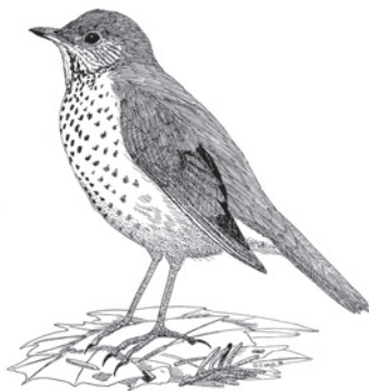
South Island Piopio ▲

Fatal weakness: Too friendly, slow, easy for predators to catch