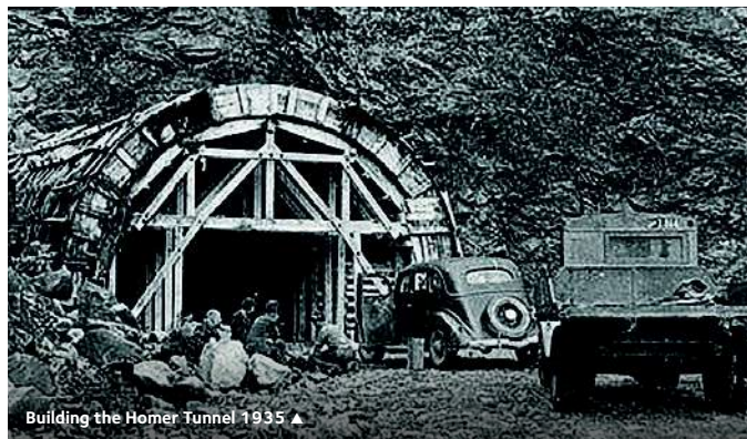
Building the Homer Tunnel 1935 ▲

Good things take time. Work on the road began in 1930, was delayed by WWII and completed in 1954. The Homer Tunnel was started in 1935 but not completed until 1953. It began with just five men using picks and wheelbarrows. It was hard, demanding work – they lived in canvas tents and makeshift buildings and were at the mercy of 'dry avalanches', noiseless falls proceeded by an extremely violent compressed air blast. With no time to avoid them workers were killed, concrete shelters destroyed and tunnel entrances engulfed.