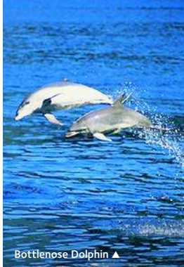
Bottlenose Dolphin ▲