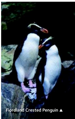
Fiordland Crested Penguin ▲